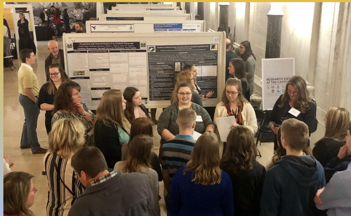
First2 Students participating in Undergraduate Research Day at the Capitol