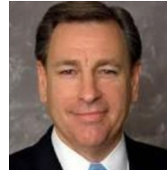
Senator Robert Plymale